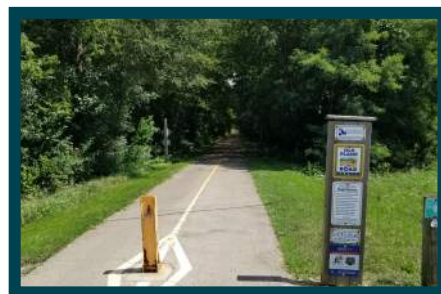
Old Plank Road Trail