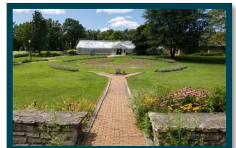
Bird Haven Greenhouse & Conservatory