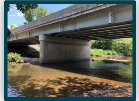
Hickory Creek Bridge

Section 4(f) properties along the Gougar Road corridor include properties owned by the Joliet Park District and Will County Forest Preserve District, such as Pilcher Park, Bird Haven Greenhouse and Conservatory, Potawatomi Woods, Higginbotham Woods, and Old Plank Road Trail.